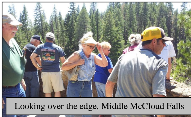
Looking over the edge, Middle McCloud Falls