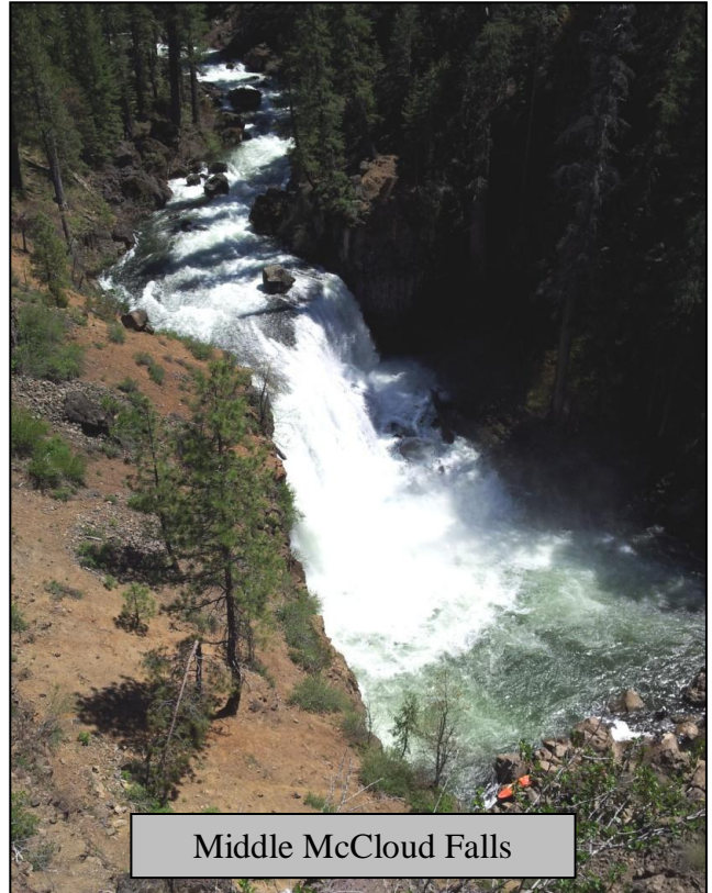
Middle McCloud Falls