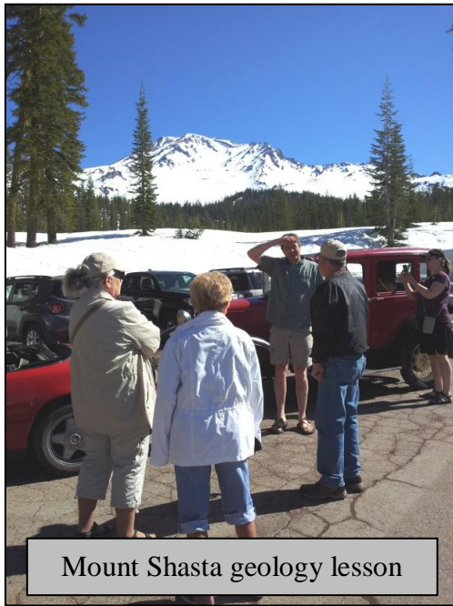
Mount Shasta geology lesson