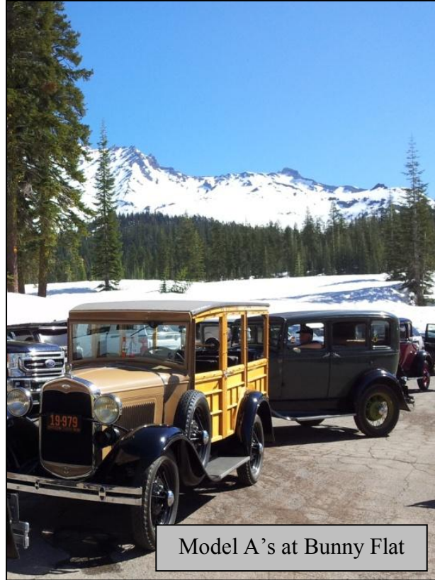
Model A's at Bunny Flat