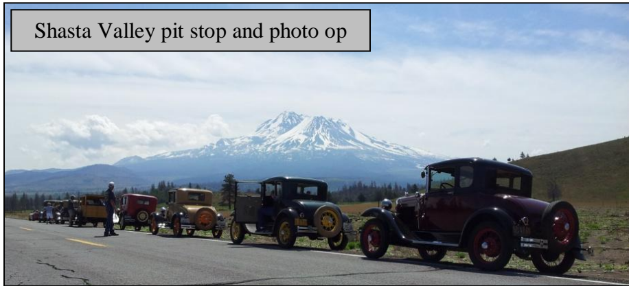
Shasta Valley pit stop and photo op