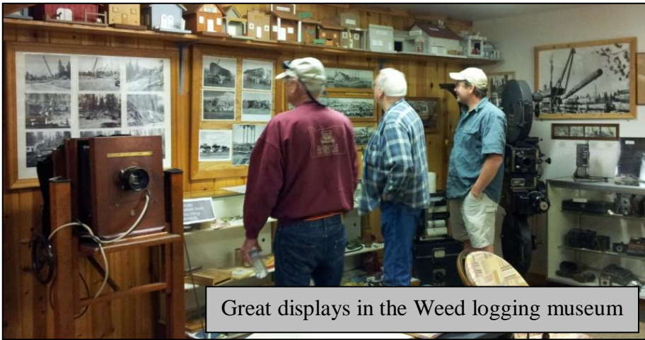
Great displays in the Weed logging museum