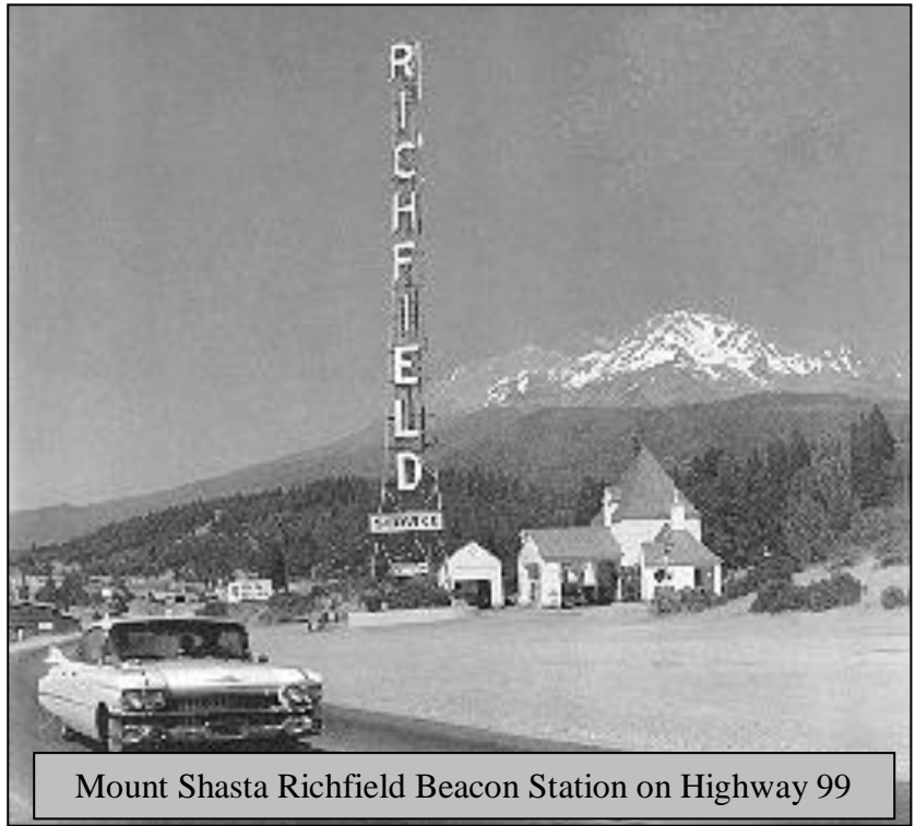
Mount Shasta Richfield Beacon Station on Highway 99